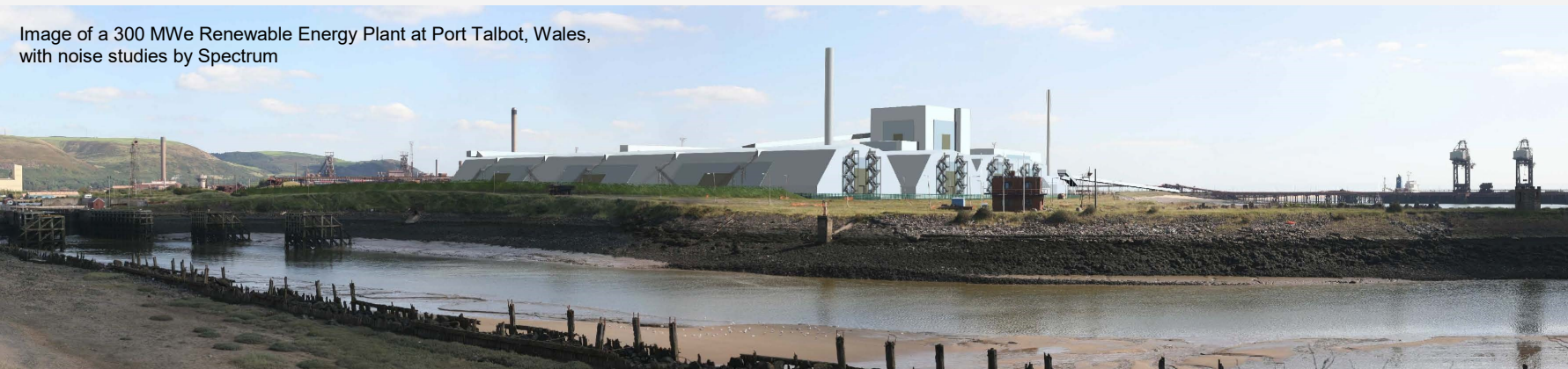
Image of a 300 MWe Renewable Energy Plant at Port Talbot, Wales, with noise studies by Spectrum

For more information or to receive a quote, email us at enquiries@spectrumacoustic.com